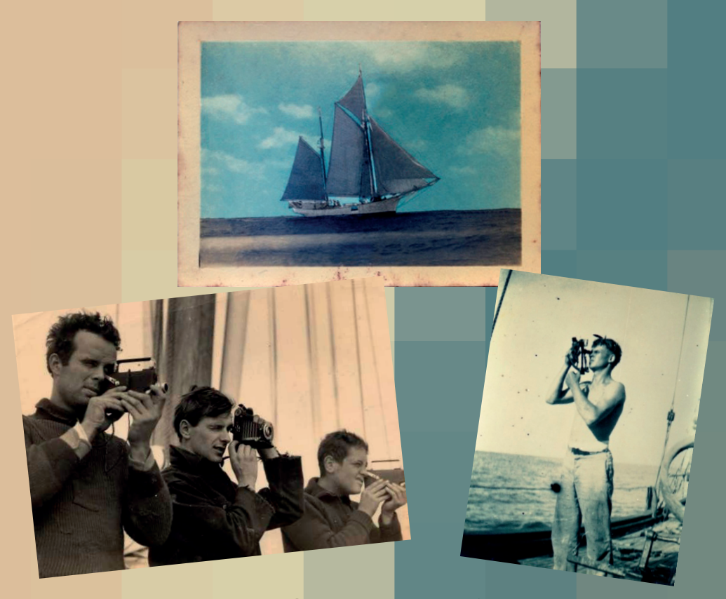
Documentary film 'Ahto. Chasing a Dream' by Jaanis Valk. Screening on November 8th at 16.15.