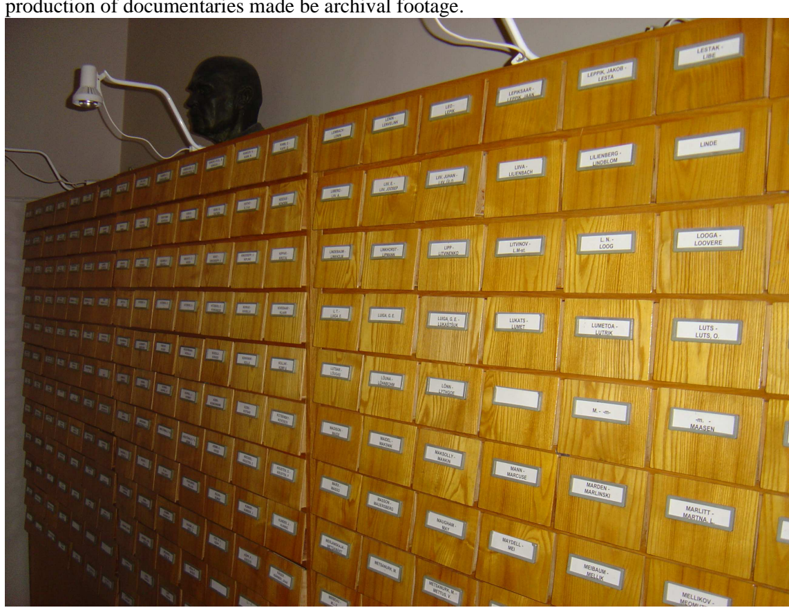
THE BANK- THE ARCHIVE- THE LIBRARY

The purpose of the paper presented at BAAC conference in Riga , October 4-6, 2010 , is to give those of you who are working with catalogues some ideas about how to improve the standard of the content of the catalogues. We all need to return the attention to some basic rules for making the catalogues independent about the format of the catalogue. Those of you who are still working with card catalogues only might also profit getting some information about how to improve the standard of the catalogues. Knowledge of the new digital technology is not needed to understand my point of views about making the content of the collections more attractive for researchers and librarians and the most important users: The Media journalists, the Television producers and the Heads of the department for future production of documentaries made be archival footage.