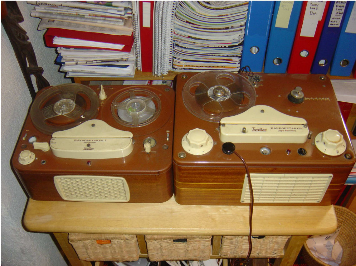
The tape recorder to the right in the photo was the first tape recorder released for sale in Norway. My family bought the recorder in the late fifties. The tape recorder to the left is a modern version of the same recorder. Both are still in use.